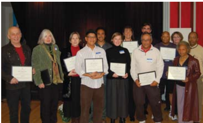
SFPT Awarded $17,950 to 12 community organizations in its first annual Innovator Awards on March 1, 2007.

Contact us if your garden or youth group would like to participate in the Street Parks Youth program. Be sure to sign up at www.sfpt.org for the Street Parks' Dirt , a new monthly newsletter with event updates, garden news and helpful tips.