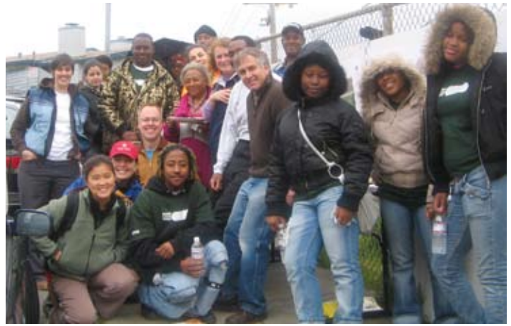
Street Parks Youth and SFPT staff in the Bayview.

Street Parks bring communities together, and are sustained by active involvement from a diverse community of dedicated partners. In addition to working with San Francisco Recreation & Park Department, we're collaborating with amazing organizations