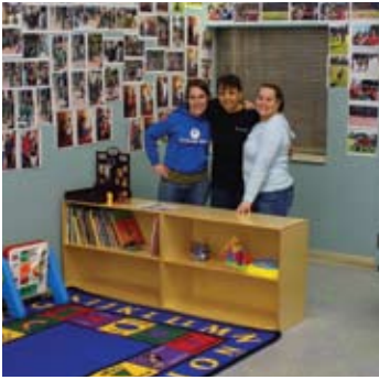
Boeddeker Park's children's reading room after a SFPT-led Project ReCreation volunteer day.